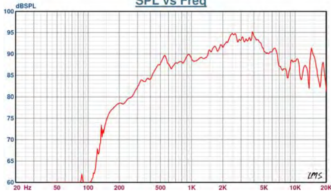
Sound pressure levels at 1W/1m SPL vs Freq